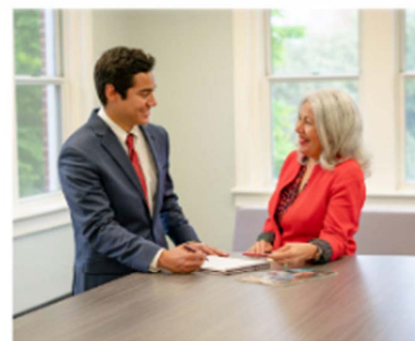
MEET YOUR CAREER COACH